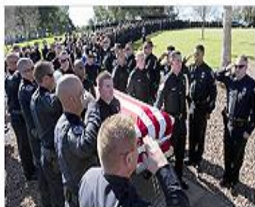
Riverside police officers salute as the casket carrying slain Riverside...

From ALA President - Just wanted to say "THANK YOU" to the whole Legion Family for all your help and support for this year so far. We have had sooo many great functions. Let the good times continue to roll!! A special Thank You to Best Buy, Home Depot and Lowes for all the support with donations for our fundraisers and all of the Ladies for your hard work and wonderful contributions. We are now over half way through our year and I know it will just get better. We have a Marathon Bunco for education on March 2nd and our Fish Fry on Good Friday 3/29/13. Hope to see you there!! Remember, we have Wednesday Lunches hosted by the Legion Family. In these trying times I am truly grateful that our ALA represents our Post with gracious STYLE and enthusiasm. See you soon.